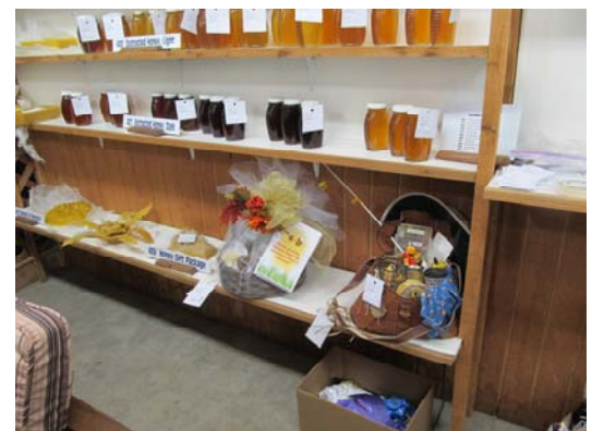
Past year's KS Fair entries

Another huge Thank You to all members, youth scholarship recipients and other volunteers who helped prepare and operate the booth for this year's fair!