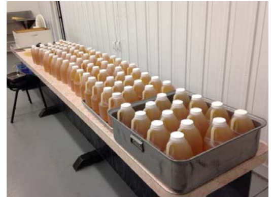
Honey ready for delivery to the State Fair from Ellis County

This issue of Cappings is being printed and edited while the 2014 Kansas State Fair is underway. Fair judging results follow on pages 9 & 10.