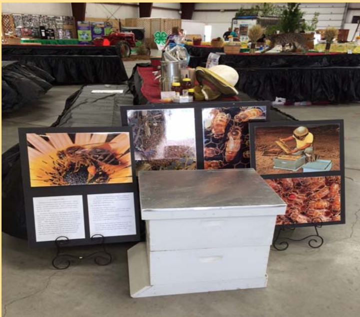
Pollinator display at Barton Co. Fair—July 2014