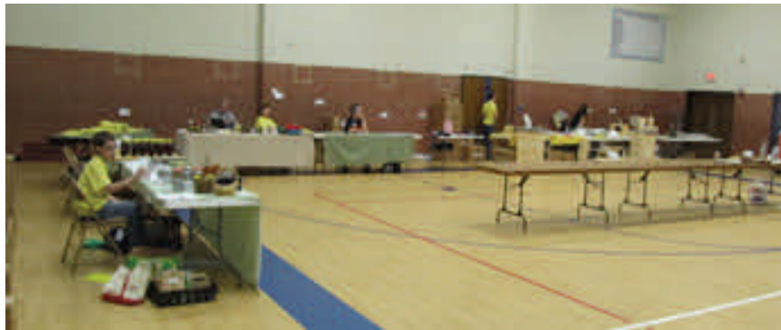
Vendors displayed beekeeping supplies and equipment, soaps/lotions, T-shirts along with a variety of items for sale.

Right, Kat Pogatshnik performs an old-fashioned candle making demonstration at Bee Fest. Using a wood-fired bees wax melter, Kat makes beautiful and unique candles. 9-30-2017