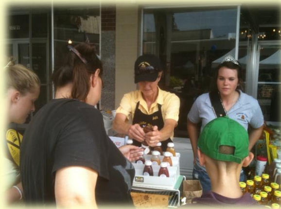
Working the crowd and answering questions