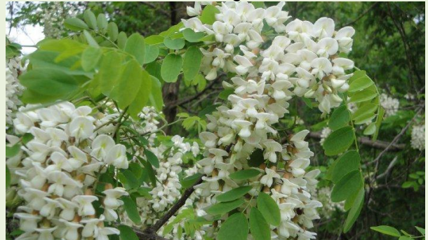
Black Locust and